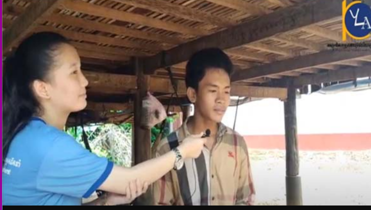
Survival student duringCovid-19 pandemic https://www.youtube.com/watch?v=UvgLhRRaqh0