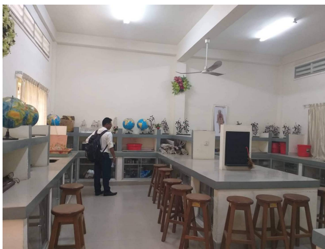
A science lab at one of the Resource Centers visited by the survey team.

Each Resource Center in an SRS has two science labs designed to promote practical work in teaching students about chemistry, physics, and biology. Investigators tried to assess the degree of student access to the labs and some of the key challenges in optimizing such access as well as their effective use. When asked about student access, school managers tended to give the most positive assessments with 57% indicating that ‘students use the labs a great deal.’ However, only 41% of teachers expressed this view while among students the response frequency was only 8%. Indeed, the highest response frequencies registered by students were for ‘use the labs some of the time’ (43%) and ‘do not use the labs much’ (34%) (see Table 3.25). This pattern of response demonstrates a major divergence in views among key stakeholders that may suggest that school managers (and to a lesser degree teachers) are deceiving themselves about the rate of lab utilization.