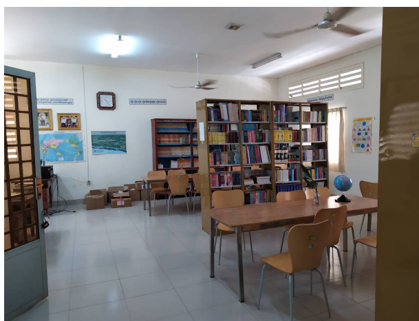
Resource Center Libraries provide books but no digital resources for students

The most daunting challenges in making the library function as cited by stakeholders were highly convergent (see Table 3.28). All stakeholders consistently identified two challenges as among the most important. These included the observation that students have little time to utilize the library and that there are no digital or internet services. Although stakeholders differed slightly in how they ranked these challenges, all identified them as among the top three issues. Teachers and students also agreed that the lack of materials and research books was a key concern; each of them ranked this challenge as (2). Lesser challenges that nevertheless had high rates of responding included the observation that ‘teachers lack capacity to link the libraries with their teaching’ (a major concern among school managers) and that they have ‘no time’ to do so (a concern expressed by teachers). These observations will be very useful to programmers as they start to formulate technical inputs to improve library services, especially as this concerns considerations of digital resources, timetables, and additional research materials.