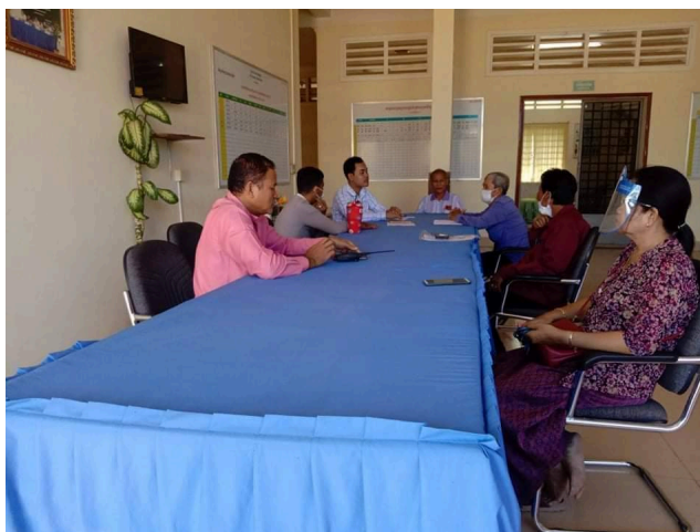
Focus Group Discussion with Community Representatives at a Secondary Resource School.

In spite of the hopeful findings suggested above, there is often a tendency among many Cambodian educators to attribute certain attitudes to parents that communities often reject. For example, school managers and teachers often suggest that parents do not value education or fail to make time to be involved in school affairs. Open-ended responses by those participating in the survey by school managers and teachers tended to confirm that these biases do still exist among many of the individuals in surveyed schools (see selected responses in Box 3.4). These responses suggest a failure to look critically at one’s own behaviors where many teachers prioritize their private classes over regular public teaching, extort money from students, and discriminate against poor students. Many school managers similarly turn a blind eye to these practices. Is it any wonder then that parents might put a low priority on working with schools and their operators? Focus group discussions with community members on the other hand found that parents take a much more cheerful view of things and stated that school-community relations were quite good and had few obstacles (see Box 3.4). These patterns of responding once again show a high degree of divergence in attitudes among key school stakeholders on the same topic and suggest the need for considerable bridge building activities during the design and implementation of project interventions.