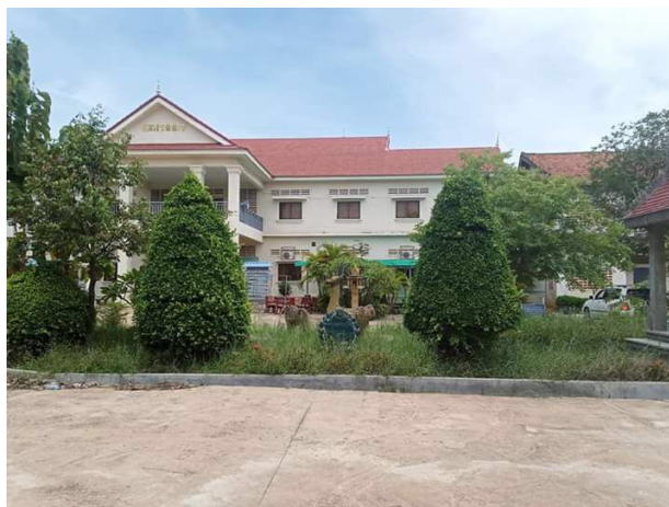
The exterior of a school Resource Center in a surveyed school

What the assessment has found is that stakeholders, including school managers (school directors and vice directors), teachers, community members, and students have attitudes about education that are frequently divergent on many issues. For example, teachers do not seem to be well-informed about school-community relations; stakeholders often seem to prioritize problems and issues very differently, and they have very different views of the issue of private classes, linked to the delivery of the state curriculum (among others). This is not to say that there has been no convergence in viewpoints (there has been), only that more divergence was reported than was originally expected, particularly in the perception of problems. In general, school managers and community members tend to be more convergent in their views than are teachers whose attitudes frequently diverge from other stakeholder groups. Understanding these points of divergence (as well as convergence) will be very useful to those providing training support to stakeholders and will help programmers to avoid some fatal assumptions about what stakeholders think or do not think.